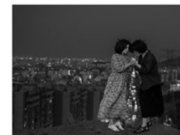
Sara Abbaspour, Untitled (Lighting Cigarettes), 2024