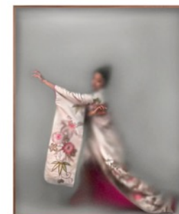
Casper Faassen, Modoko XIV V, 2024. Courtesy of Blüthner, Amsterdam

"The diverse range of exhibitors hailing from around the world presents visitors with a wealth of photography—both historic and contemporary—to explore and discover. Together, the 2025 edition of the fair promises to reaffirm why the Photography Show has maintained its stature as a premier destination for collecting and learning about the medium."